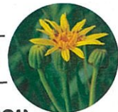
Hankaisou ( Ligularia japonica ) middle July - middle Aug.