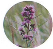
Yama azami ( Cirsium spicatum ) middle Aug. - middle Sep.

We are at our best in the middle of August!