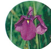
Nohana shoubu ( Iris ensata var. spontanea ) early July - late July