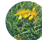
Kouraitomoesou ( Hypericaceae asyron ) late July - middle Aug.