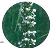
Mizuchidori ( Platanthera hologlottis ) early July - middle July