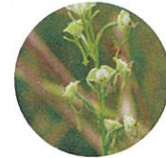
Mizutonbo ( Habenaria sagittifera ) early Aug. - late Aug.

You can find me at the corner of the wooden path!