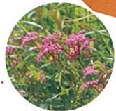
Shimotsukesou ( Filipendula multijuga ) late July - middle Aug.

My flowers look like jewels under a magnifier.