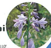
Kobagiboushi ( Hosta sieboldii ) late July - middle Aug.