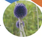
Higotai ( Echinops setifer ) late July - late Aug.

We are at our best in the middle of August!