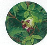
Tsuruninjin ( Codonopsis lanceolata ) late Aug. - middle Sep.

You can find me at the corner of the wooden path!