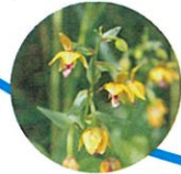
Kaki ran ( Epipactis thumbergii ) early July - middle July