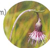
Kiseru Azami ( Cirsium sieboldii ) late Aug. - middle Sep.