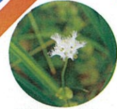
Shirahigesou ( Parnassia foliosa ) middle Aug. - early Sep.

We bloom in the evening. Come to see us and cool off.