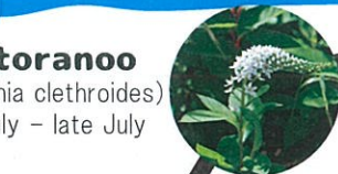
Okatoranoo ( Lysimachia clethroides ) early July - late July

Just a minute walk from Visitor Center to the entrance of Tadewara marsh.