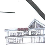
Monument of the Source of Chikugo River