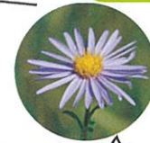
Higoshion ( Aster maackii ) Mid-Sep.-early Nov.