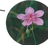
Tsukushifuro ( Geranium soboliferum ) late Aug. - middle Sep.