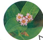
Mizuotogiri ( Triadenum japonicum ) early Aug. - middle Aug.

We bloom in the evening. Come to see us and cool off.