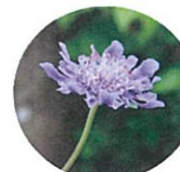
Matsumushisou ( Scabiosa japonica ) late Aug. - middle Sep.